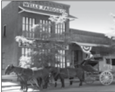
Columbia Chamber of Commerce (Main Distribution, Columbia Mercantile)

10,000 circulation every three months (2.5 readers per copy)