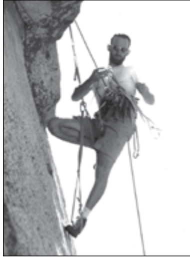
Royal Robbins aid climbing on the third pitch on Salathé Wall in a photo titled Cool Aid.