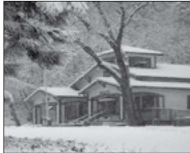
Yosemite Bank (Groveland, Mariposa, Oakhurst, Coarsegold)