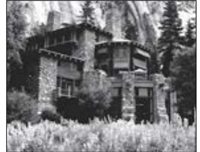
The Majestic Yosemite Hotel (aka The Ahwahnee–Yosemite National Park)