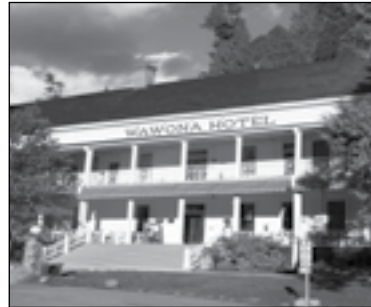
Wawona Hotel (Mariposa County and Hwy 140 corridor)